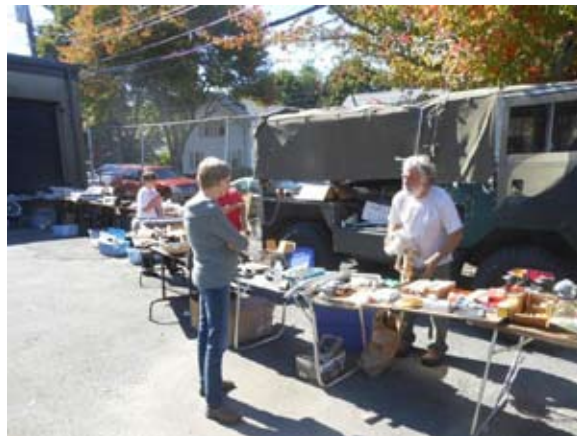
Some of the types of parts available at the autojumble.

Directions: Endicott St. is off of Walpole St. (route 1A) in Norwood. Proceed to the end of the street into the Norwood commerce Center. After the first speed bump and main office, stay right/ straight down the hill, then bear left over the next speed bump, then take a right and you're here.